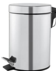
PP1303C/PP1305C/PP1312C/ PP1321C Bright finish