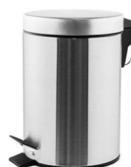
PP1303CS/PP1305CS/PP1312CS/ PP1321CS Satin finish