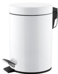
PP1303/PP1305/PP1312/ PP1321 White finish