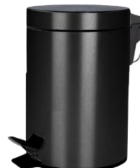
PP1303B/PP1305B/ PP1312B Black finish