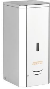
DJ0037AC/DJF0038AC/ DJS0039AC Bright finish