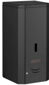
DJ0037AB/DJF0038AB/ DJS0039AB Matte black epoxy finish