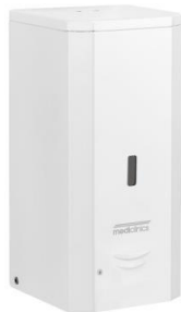
DJ0037A/DJF0038A/ DJS0039A White epoxy finish