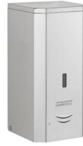
DJ0037ACS/DJF0038ACS/ DJS0039ACS Satin finish