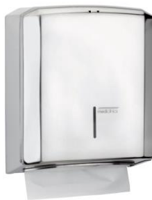
DT2106C Bright finish