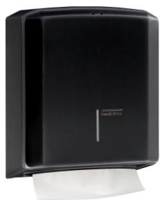
DT2106B Black epoxy finish