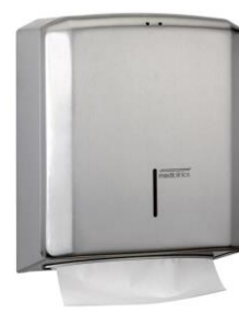
DT2106CS Satin finish