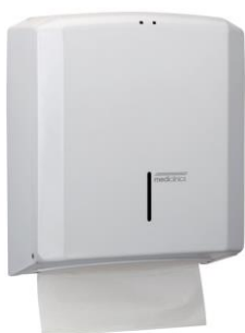
DT2106 White epoxy finish