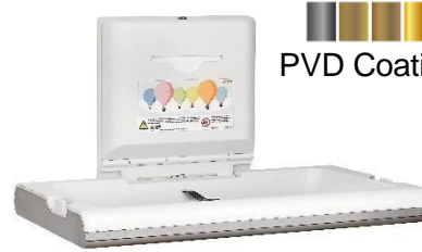
CP0016HCS Polypropylene/Stainless steel Satin finish