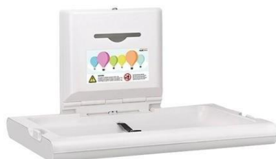
CP0016H Polypropylene White finish