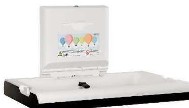
CP0016HCSB Polypropylene/Stainless steel Matte black finish